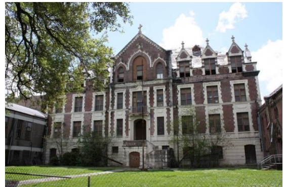
Andrew J. Bell Middle School

In 2009, FEMA, the RSD, the OPSB, the Louisiana State Historic Preservation Officer, and the Advisory Council on Historic Preservation entered into a Secondary Programmatic Agreement (RSD/OPSB 2PA) in order to fulfill FEMA's responsibilities under Section 106 of the National Historic Preservation Act and 36 CFR part 800 regarding the implementation of the School Facilities Master Plan, which will be funded with assistance from FEMA and other Federal agencies. As part of the School Facilities Master Plan, the RSD is requesting that FEMA provide funds for the following projects on the Andrew J. Bell Middle School campus: